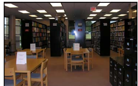
The 10,000 volume reference collection accessible to patrons in the Center's reading room includes biographies, discographies, scores, and historical and critical works.

Beyond the campus community, the Center provided research assistance to scholars from 28 states and 8 foreign countries. It is the use of our collections by national and international scholars that builds the reputation of both CPM and MTSU. These researchers are drawn by the unique resources the CPM has to offer, often traveling thousands of miles to get here, and obtaining grants to do so. They publish papers, write books, produce recordings, and present public programs that make use of these resources and thus draw attention to the strength of MTSU's intellectual and cultural resources.