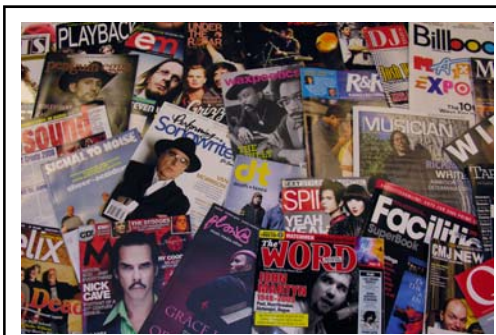
Current magazines are primary source materials for the study of 21 st century popular music.