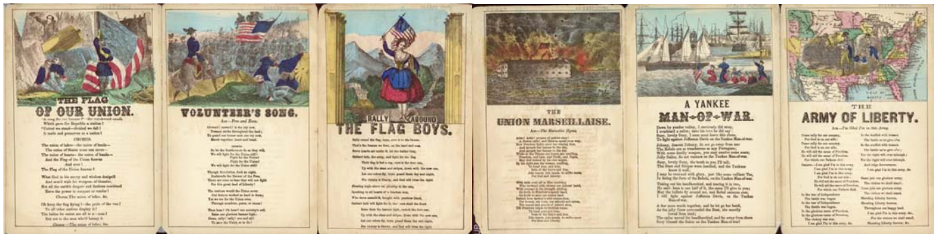
Six Military and Patriotic Illustrated Songs consists of six song broadsides joined in accordion fashion with a printed cover and back.